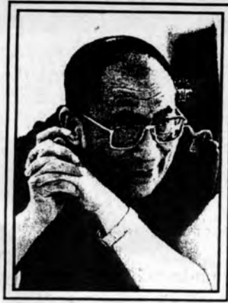
He's Got Infinite Wisdom

Write In His Holiness the Dalai Lama for SCLC Student Conduct Legislative Council