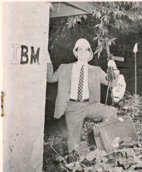
Left: The Nairobi Sales Office is the first branch to open up the East African Territory. The tremendous sales possibilities of this area are certain to be fully realized just as soon as our employees quit disappearing.

The next annual meeting will be held in the Imperial Hotel in Toyko on December 23, 1963 at 3:15 P.M. B.Y.O.L. Let's have better attendance next time, huh? It was such a poor turn out in Rangoon last year that we decided to kiss it off for a few years—it just wouldn't be worth the trouble.